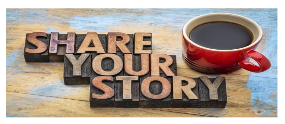
We look forward to hearing YOUR story this year as our schedule rolls out